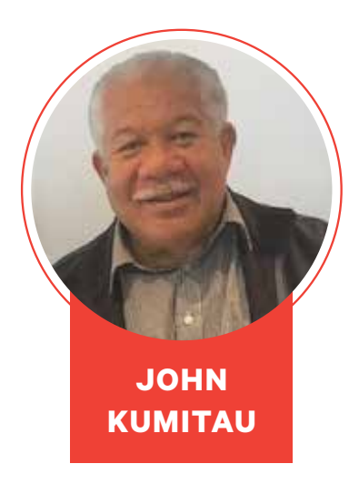
Community Engagement Advisor, HLC

The Mangere Development team is here to support you, the Mangere community, through the development journey and keep you informed about the changes happening in your neighbourhood. Find out more about your community team below.