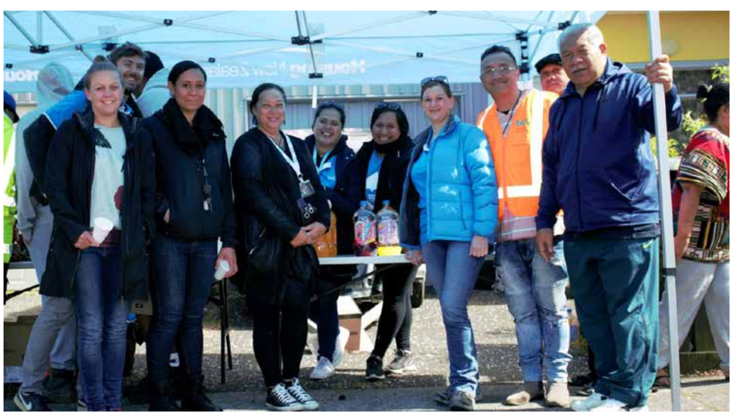
Top: Spotless contractors removed six skip bins and five truckloads worth of rubbish at the Tagata Way spring clean Above: Some of the HLC and Housing New Zealand team on the day