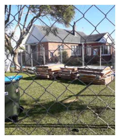
Stage 1a (right hand side) and Stage 1b (left hand side) on Bader Drive